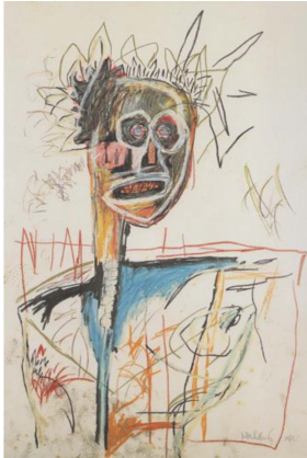
Jean-Michel Basquiat. Untitled . 1982. © The Estate of Jean-Michel Basquiat